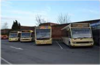
Lugg Valley buses at Hereford Bus Station