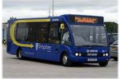
The Arriva bus as often seen in Bucknell