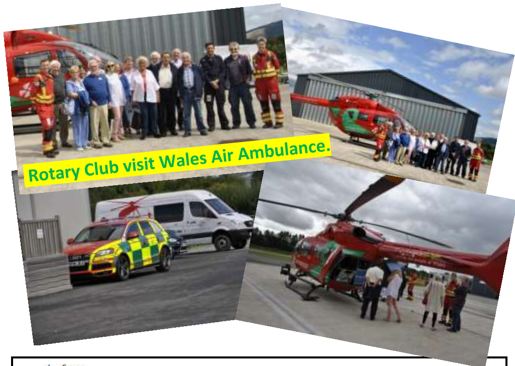
Rotary Club visit Wales Air Ambulance.